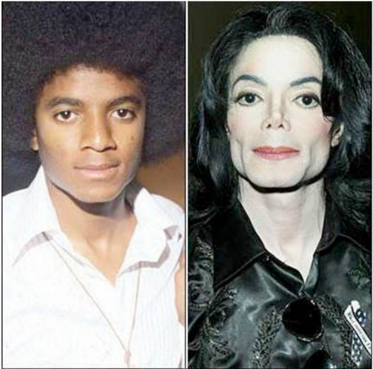
Supplementary Figure 1. Michael Jackson, before and after skin lightening.